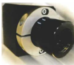
Blu-ray laser beam