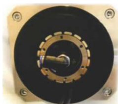
X rotary drive