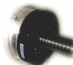
Y linear drive